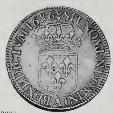
Lot No. 2678

2678 Louis XIV, 1643-1715. Ecu blanc, 1686 A. Obv. Peruked bust. Rv. Crowned Arms. Gad.213. Dav.3809. About Very Fine. (1,000-1,250)